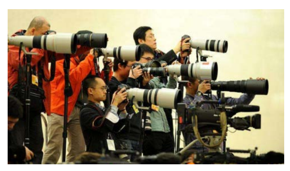
Figure 2 News photography

Finally, some journalists have a weak sense of law. Learning the law, understanding the law and abiding by the law are the professional conduct and guidelines of people in the traditional news media. But at present, under the impact of the expanding new media market, the entry threshold of journalists is getting lower and lower, and many people with low academic qualifications and low quality enter the workplace. In order to be able to gain a foothold in the process of work, at the expense of the law, constantly harass the parties to take photos, even in the report directly flow some information of the victims and minors. This disregard for the law is bound to be a vice that challenges the bottom line of journalism ethics[3].